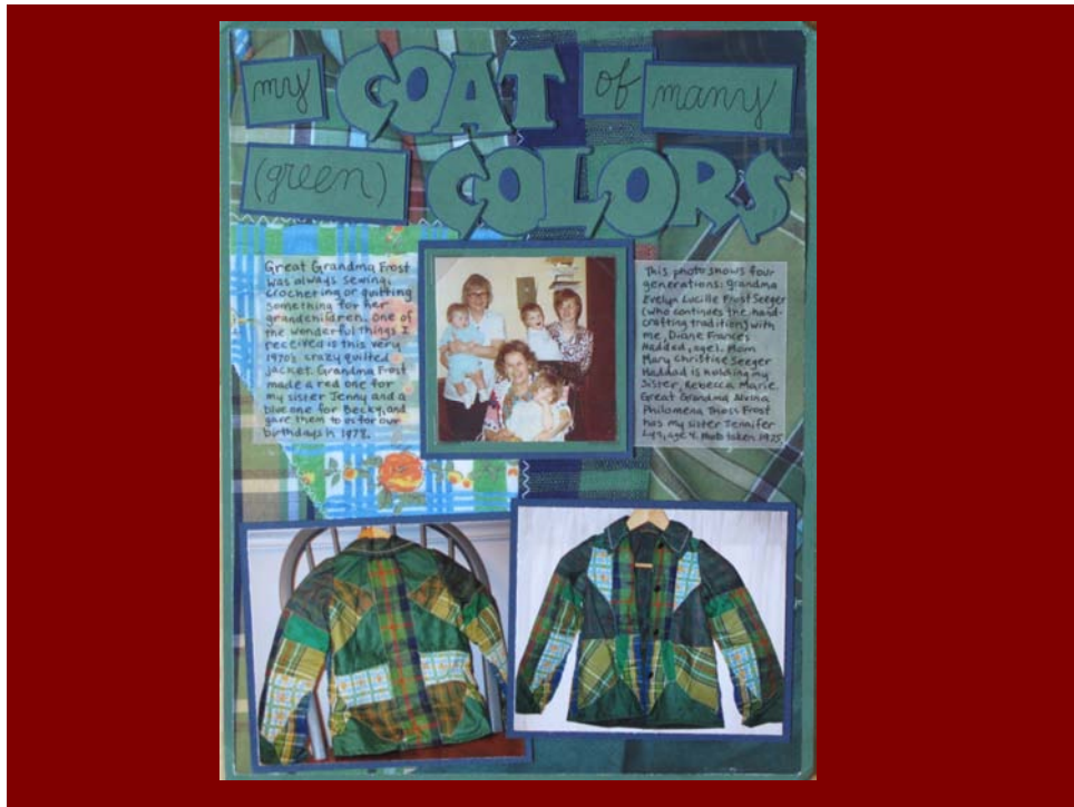
Create your own background by using a scan of a family heirloom. This is a page about a hand-made jacket. A family picture in the center is surrounded by the handwritten story. At the bottom are pictures of the front and back of the jacket. The title introduces the subject of the page.