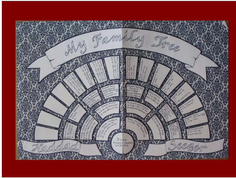
If you're making a family history scrapbook include a chart as an index.